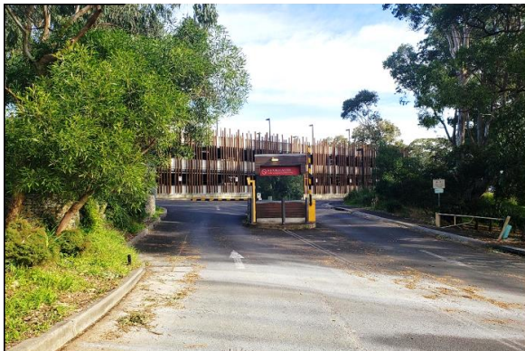
Entrance at the end of Prince Albert Street